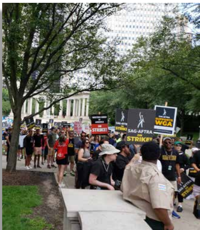
Supporters march through Millennium Park in the SAG-AFTRA Solidarity Walk and Rally.