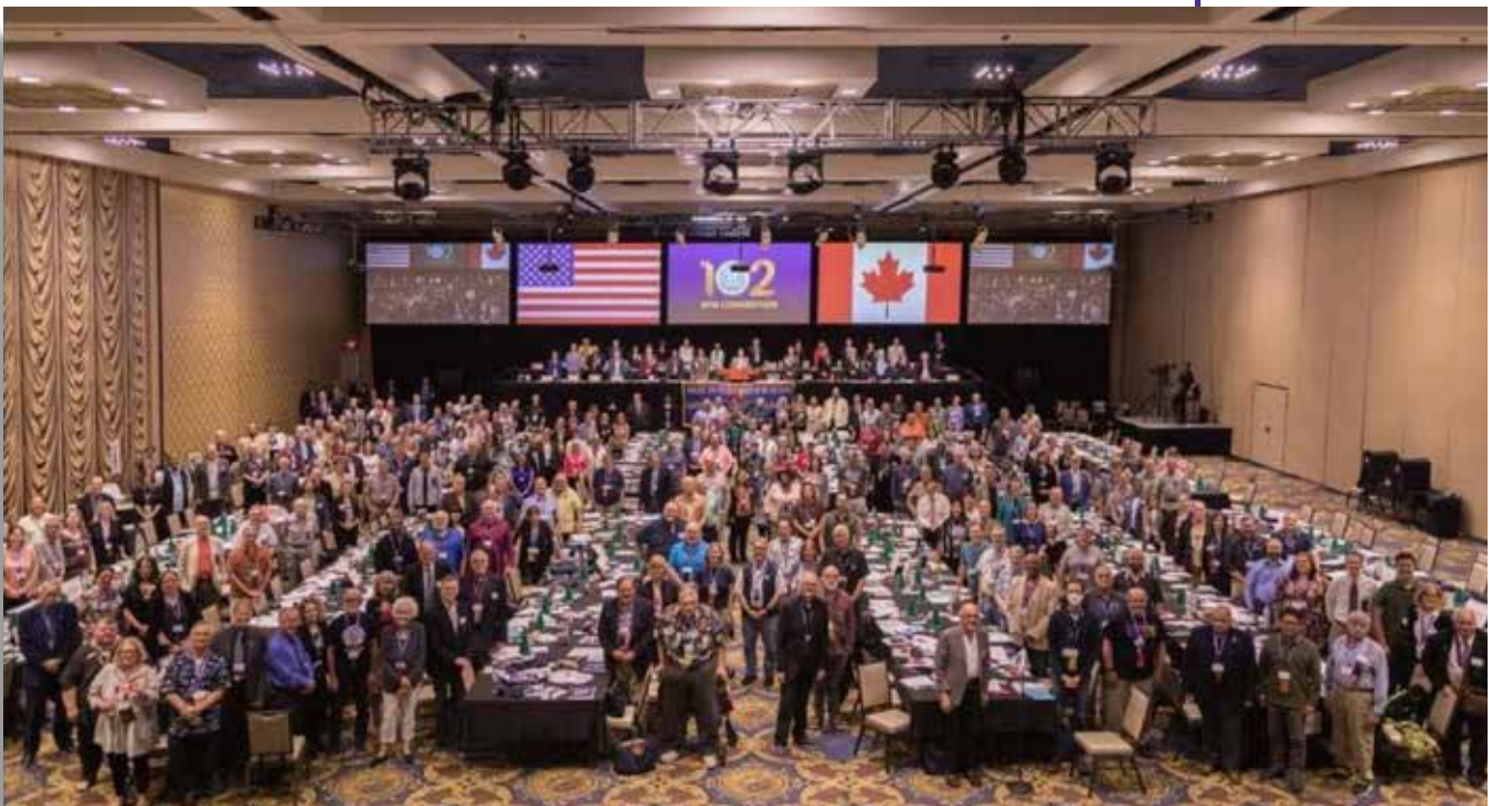
The attendees of the 102nd Convention of the American Federation of Musicians of the United States and Canada.