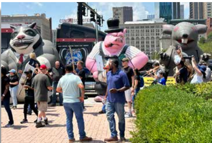
A Fat-Cat and a Corporate Pig join Scabby the Rat at the SAG-AFTRA Solidarity Walk and Rally.