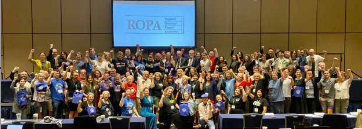
ROPA conference attendees show their support for SAG-AFTRA members while they strike.